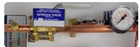
Ball Valve Configurations Available