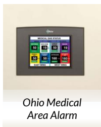
Ohio Medical Area Alarm

Also provided are two lever style wire connectors to easily establish communications from the sensors to an Ohio Medical Area Alarm. A zip tie and mounting pad provide the means of securing loose wires and neatly tying them to the interior of the zone valve box. An access hole and grommet are used on the side of the valve box to allow access to alarm wires.